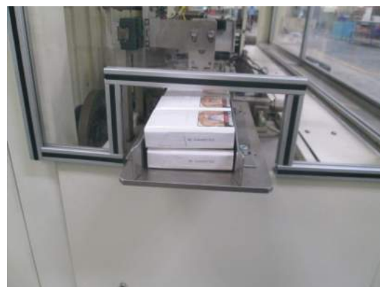
Packet collator at exit to deliver 2 high stack