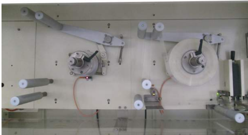
Double Bobbin holder and manual splicing deck